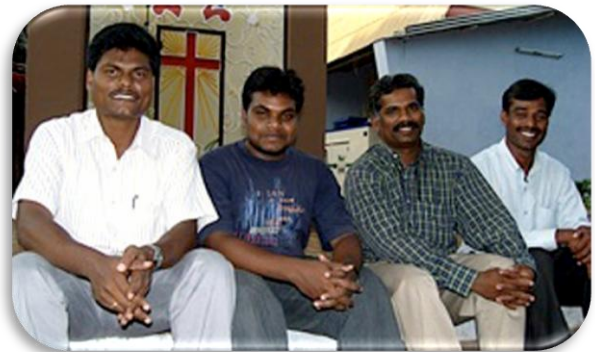
Probationers in India

From 1895 until the 1980's, the LCMS had a strong missionary presence in India. Since 1959, the India Evangelical Lutheran Church (IELC) has been an LCMS partner church. After the last LCMS career missionary retired in 2003, LCMS began sending consultants to India each year to conduct leadership training seminars.