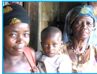
Nigerian Mother, Son and Grandmother