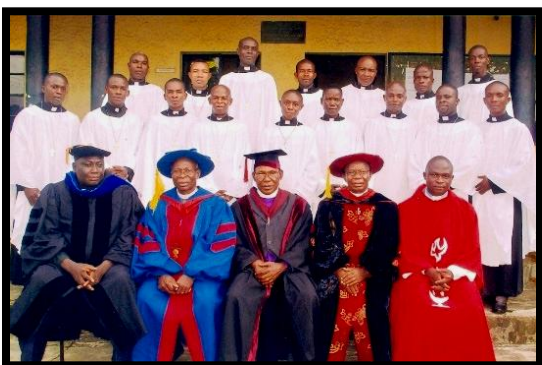
Seminary Faculty with New Pastors

The LCMS began work in Nigeria in 1936. The Lutheran Church of Nigeria is LCMS's oldest partner church in Africa, with a presence in 19 of Nigeria's 36 states. Many of the remaining states are in northern Nigeria, where an estimated 60 million Muslims live. The Lutheran Church of Nigeria has a baptized membership of more than 100,000 in 410 congregations and preaching stations, with a national staff of 260 pastors and lay preachers.