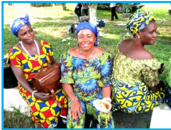
Beautiful Nigerian Women