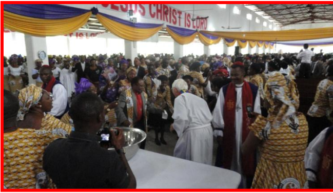
Thousands of worshippers celebrate at service on Sept. 11.